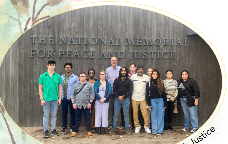
The National Memorial for Peace & Justice