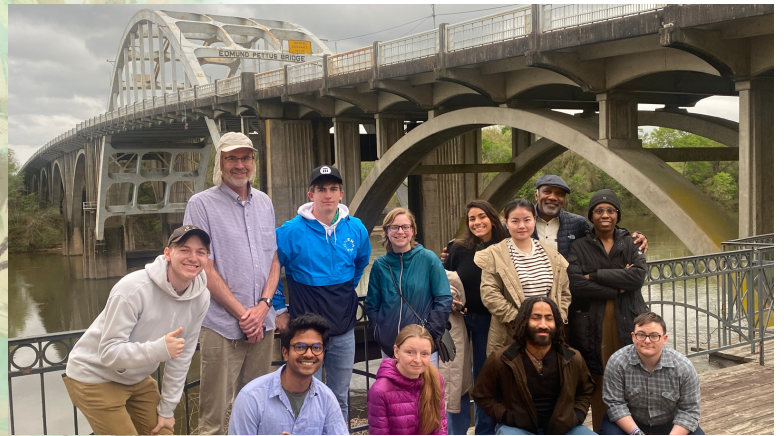
Group photo by the Selma Bridge