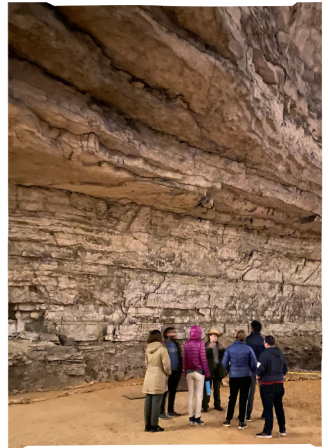
Students getting more informed at Mammoth Cave